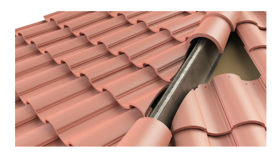
AVAILABLE IN 10' LENGTHS & 4", 5", 6", 7" HEIGHTS